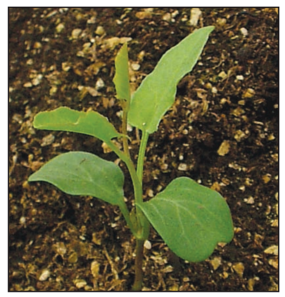
Figure 1. Field bindweed at the seedling stage.