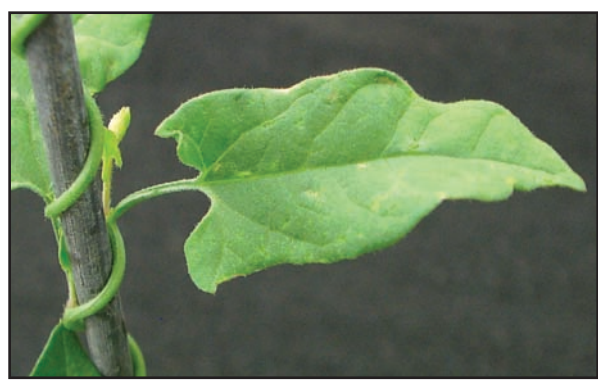
Figure 2. The leaf of field bindweed.